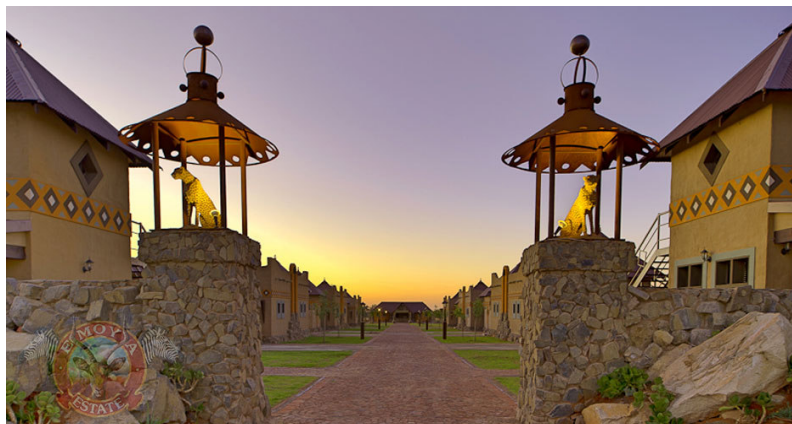
Emoya Wildlife Estate